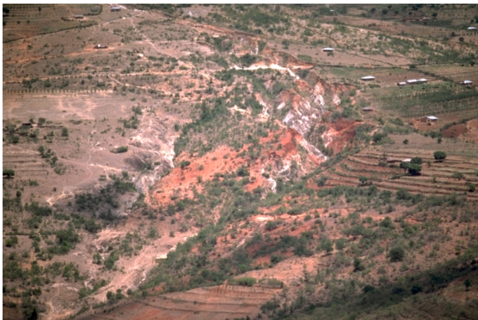
Figure 1. Land degradation and conservation in Machakos district, Kenya.

WOCAT has launched this new initiative for a global SWC map in order to show in which areas water, soil and vegetation are used sustainably. Existing maps show degradation at various scales for various land use and degradation types, but there are hardly any maps focusing on the positive aspect of the countless conservation efforts undertaken all over the world. Along with the demand for such maps at a regional, national, or sub-national level, there is also a need for a global-scale overview of achievements in preventing and combating land degradation.